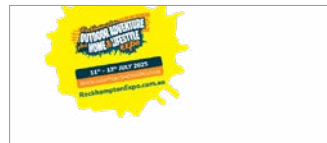
Facebook Cover Template 2