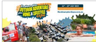
Facebook Cover 1