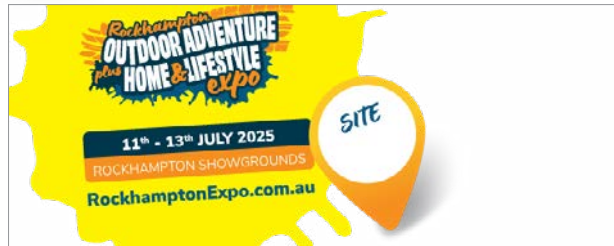
Email Signature Template 1