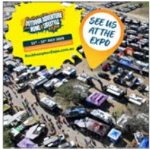
Social Media Post 1