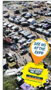
Social Media Story