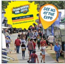
Social Media Post 2