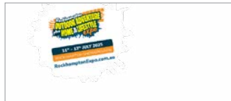
Facebook Cover Template 1