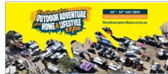
Facebook Cover 2