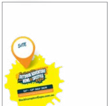
Social Media Post Template 1