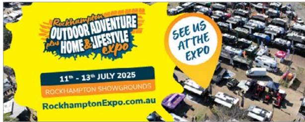
Email Signature 1